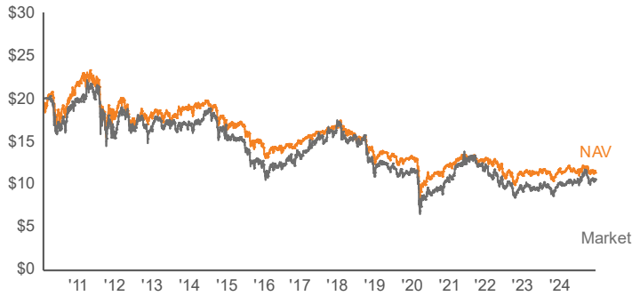
Share Price and NAV History